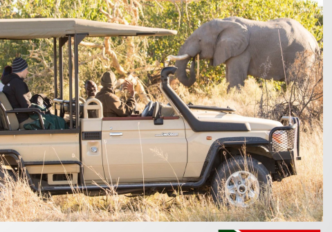
South Africa The Big Five