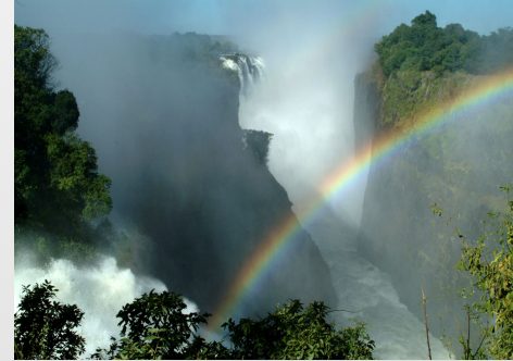
Zimbabwe Incredible Victoria Falls