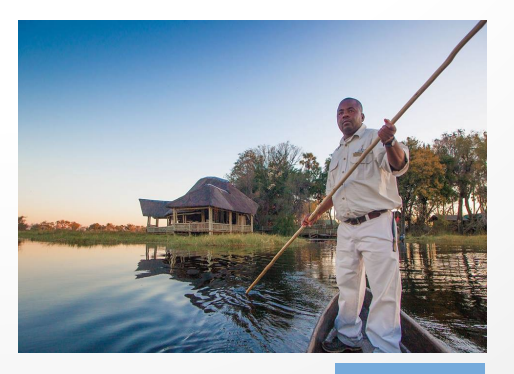
Botswana Okavango Delta