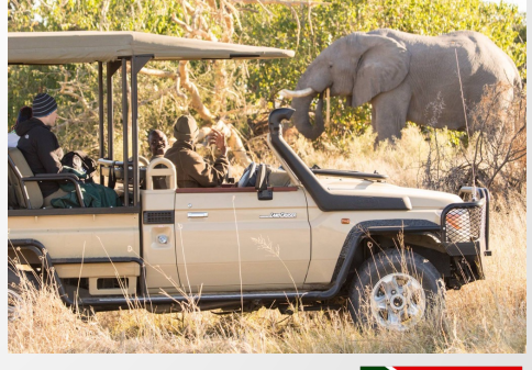
South Africa The Big Five