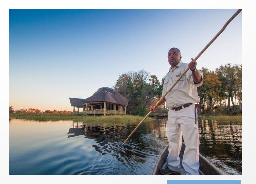
Botswana Okavango Delta