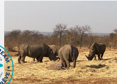
Zambia Rhino Experience