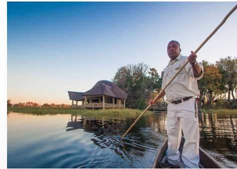
Botswana Okavango Delta