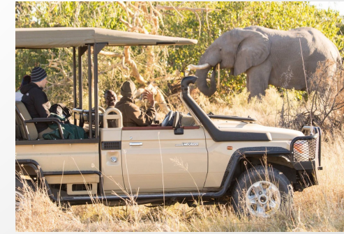
South Africa The Big Five