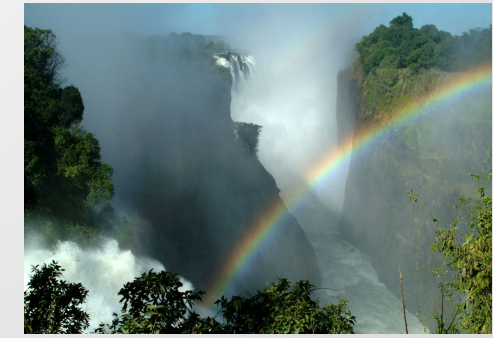
Zimbabwe Incredible Victoria Falls