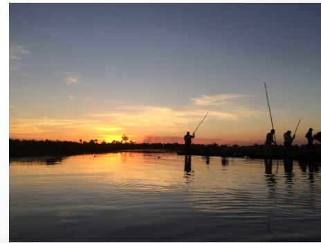
Botswana Okavango Delta