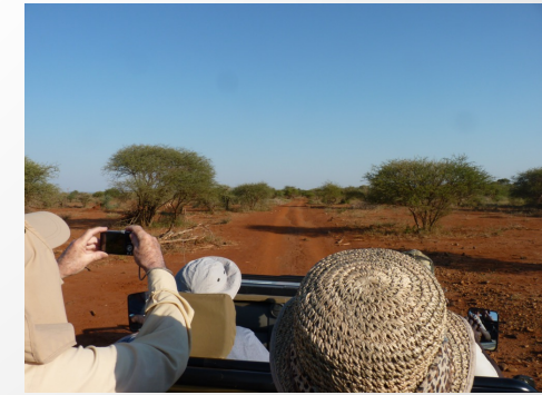
South Africa The Big Five