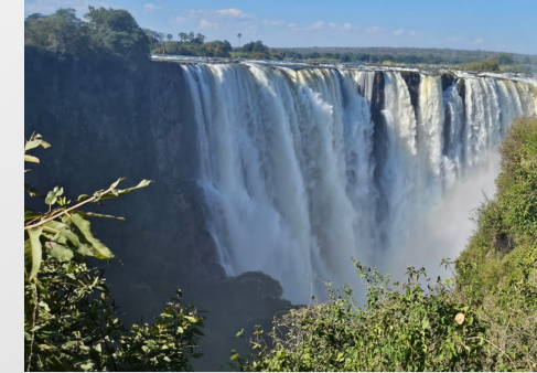
Zimbabwe Incredible Victoria Falls